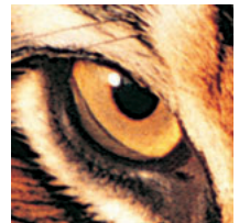
Saved at 150 dpi