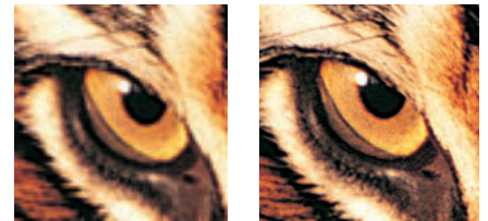
Saved at 72 dpi